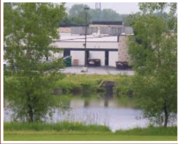
Sweeping parking lots and streets can be part of a larger effort to keep pollutants out of streams and lakes.